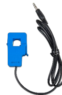
Current sensor To implement PowerControl and PowerAssist.