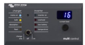
Digital Multi Control Panel A convenient and low-cost solution for remote monitoring, with a rotary knob to set PowerControl and PowerAssist levels.