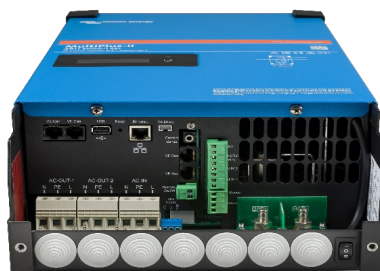
Connection Area MultiPlus-II 3k GX